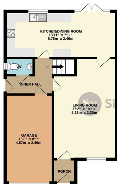
GROUND FLOOR 522 sq.ft. (48.5 sq.m.) approx.