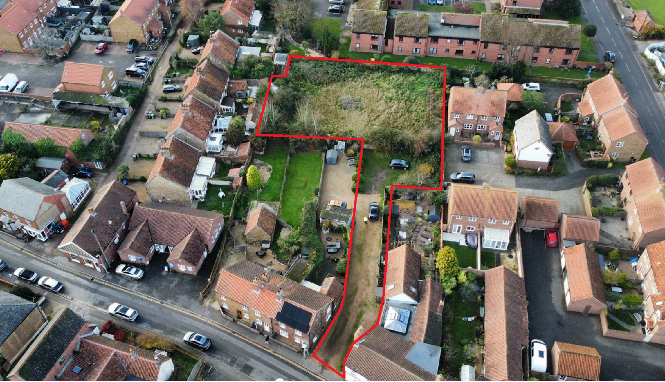
Former Heacham Bowling Green, High Street, Heacham