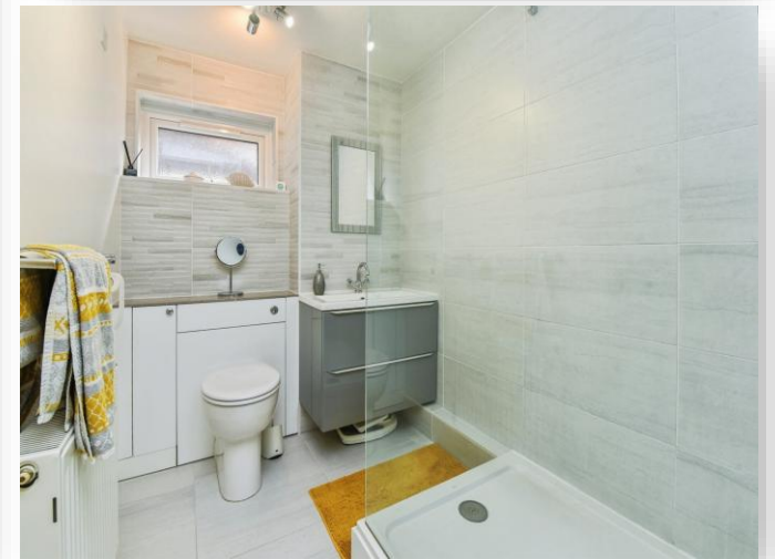
Mill Close, Frome, BA11 2LR