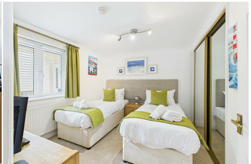
Carbis Beach Apartments, Carbis Bay, St. Ives, TR26 2JL