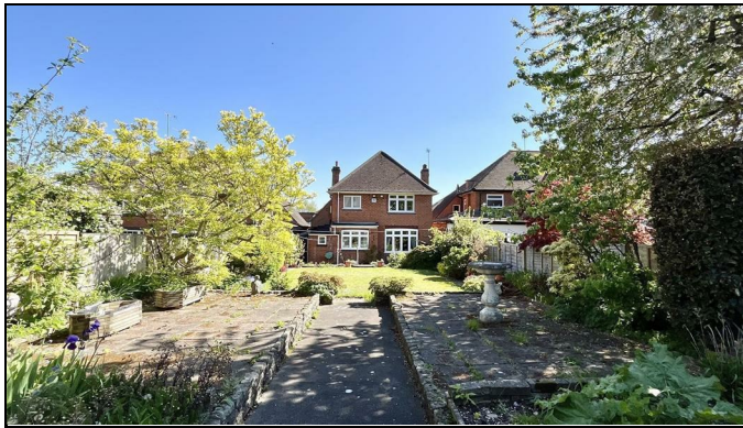
Beeches Drive, B24 0DU