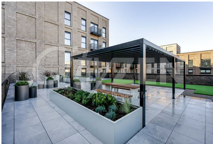
RESIDENTS ROOF GARDEN