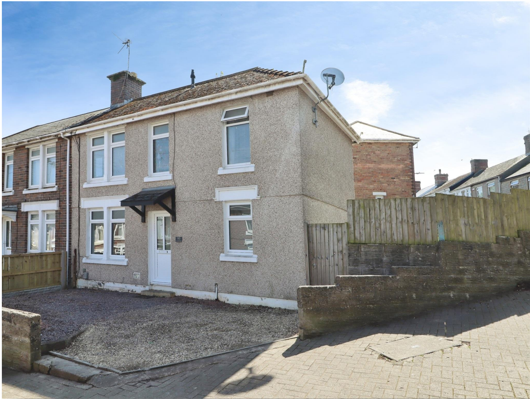
Cawley Place, Barry CF63 2HS