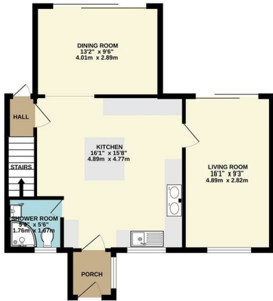
GROUND FLOOR 594 sq.ft. (55.2 sq.m.) approx.