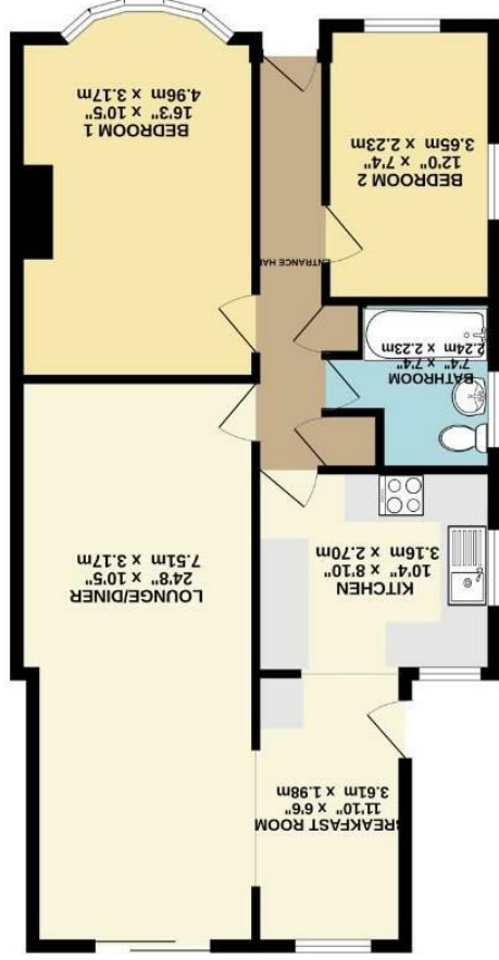
GROUND FLOOR 769 sq.ft. (71.4 sq.m.) approx.

What every attempt has been made to ensure the accuracy of the diagram contained here, measurements of doors, windows, doors and any other items are given to the nearest millimetre. This plan is for guidance purposes only and should be used as such by any prospective purchaser. The services, fixtures and appliances shown have not been tested and no guarantee as to their quality or energy can be given. Made with Mapbox ©2025