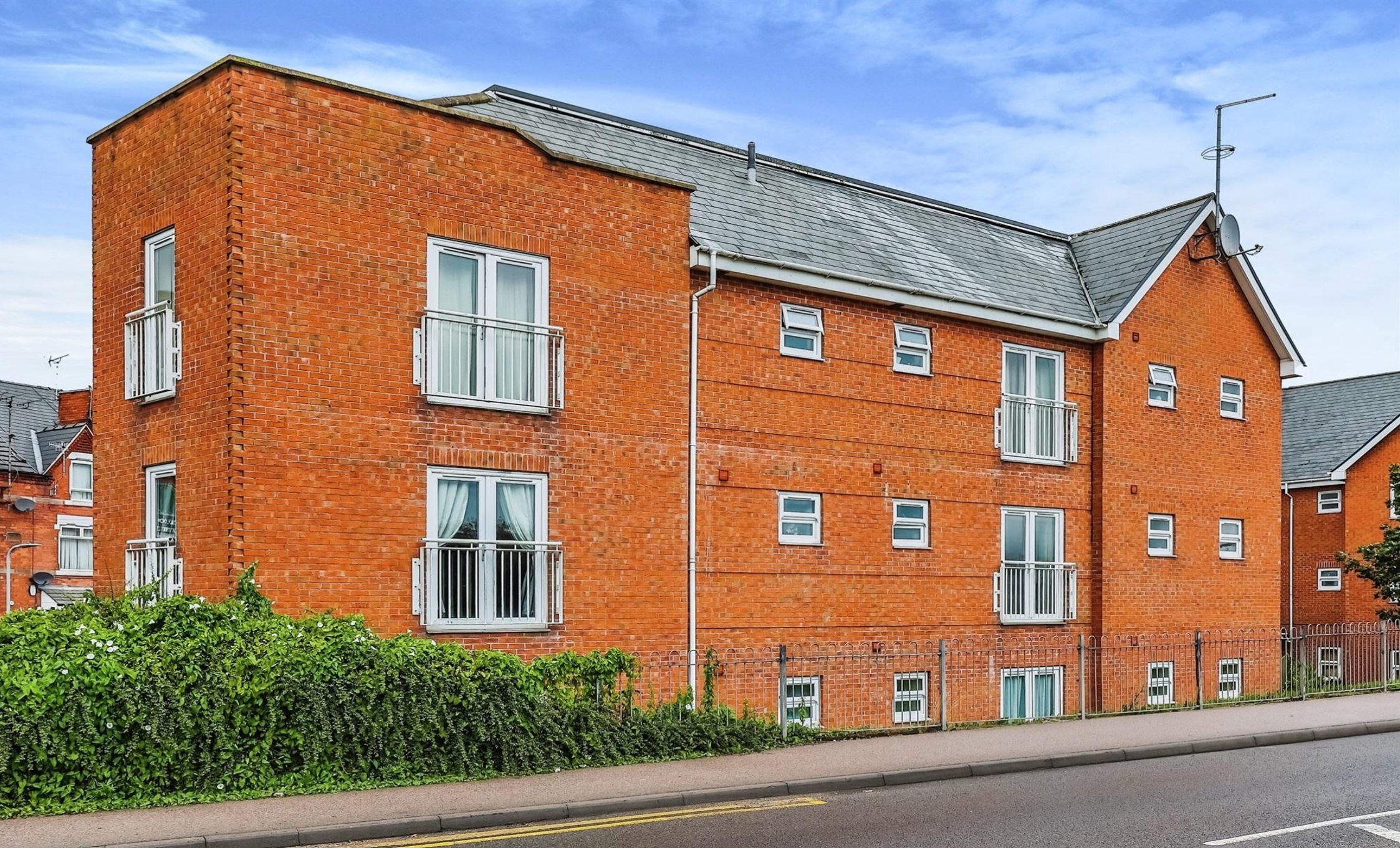
The Junction Station Terrace Hucknall Nottingham