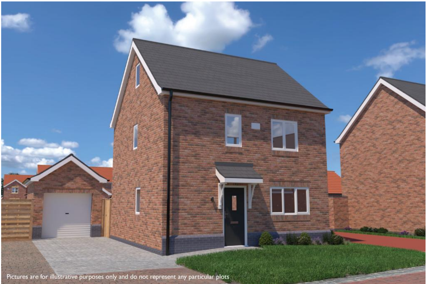
Pictures are for illustrative purposes only and do not represent any particular plots