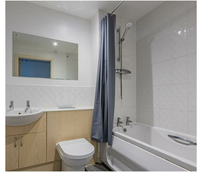
Picton, Victoria Wharf, Cardiff Bay