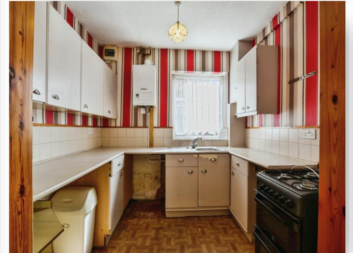
Burgh Road, Skegness PE25 2RA