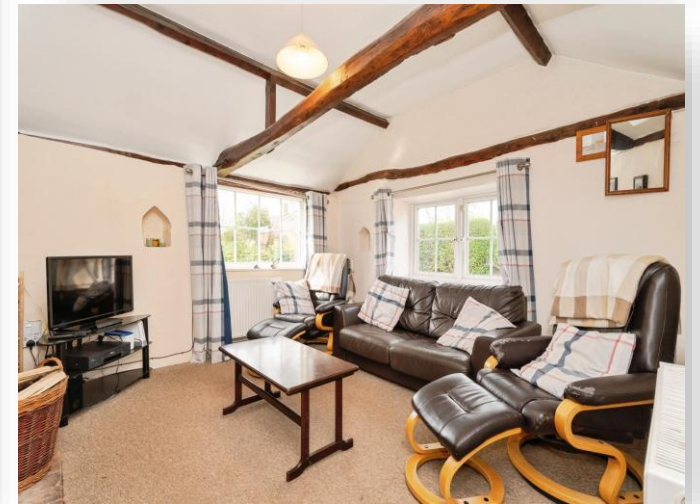
Mill Road, Briston, Melton Constable, NR24 2JF