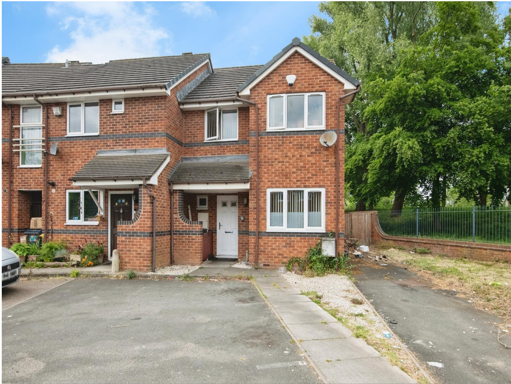
Wheeler Street,Lozells Birmingham B19 2EL