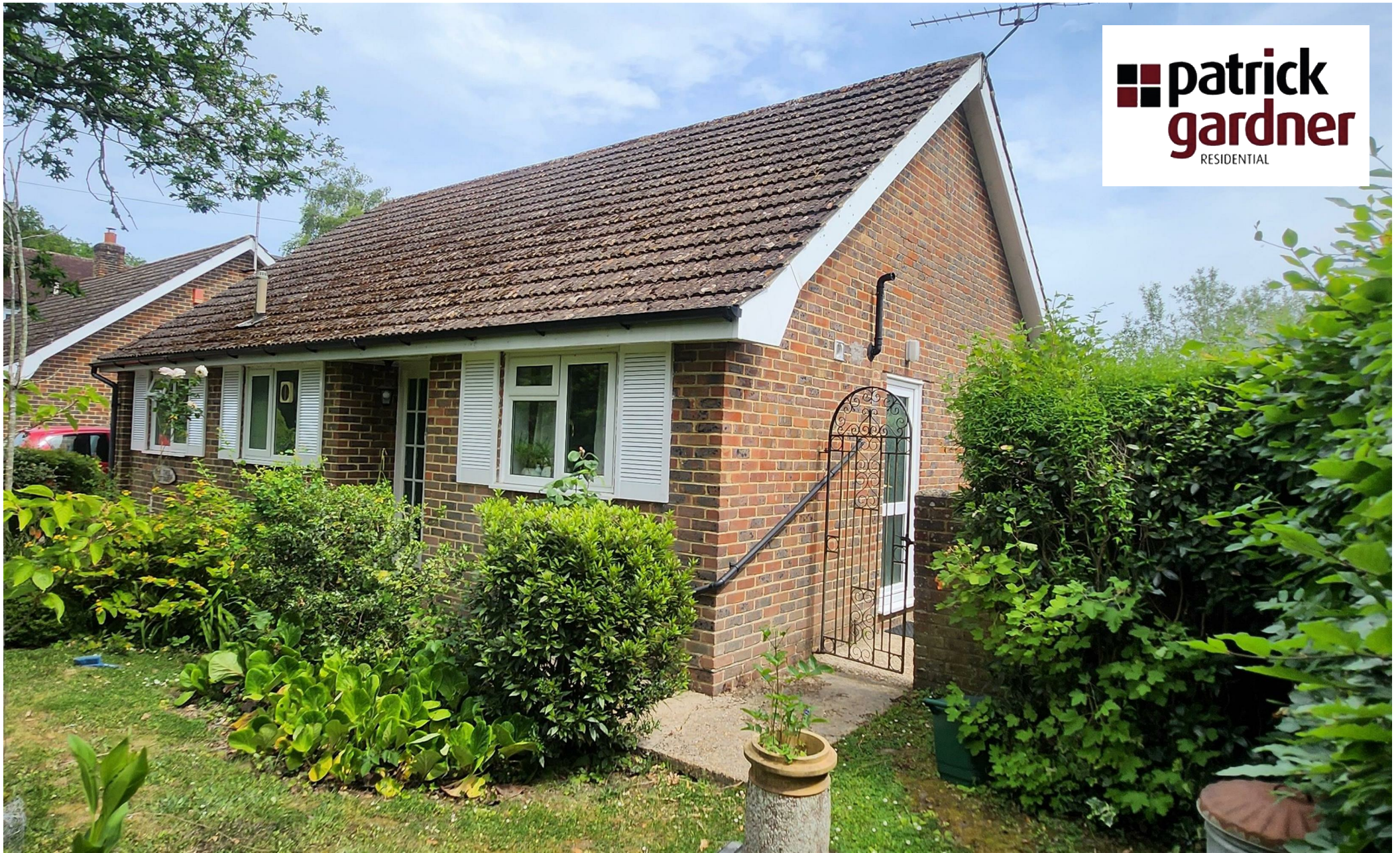
Oak Tree Cottage Broad Lane, Newdigate, Dorking, Surrey, RH5 5AT