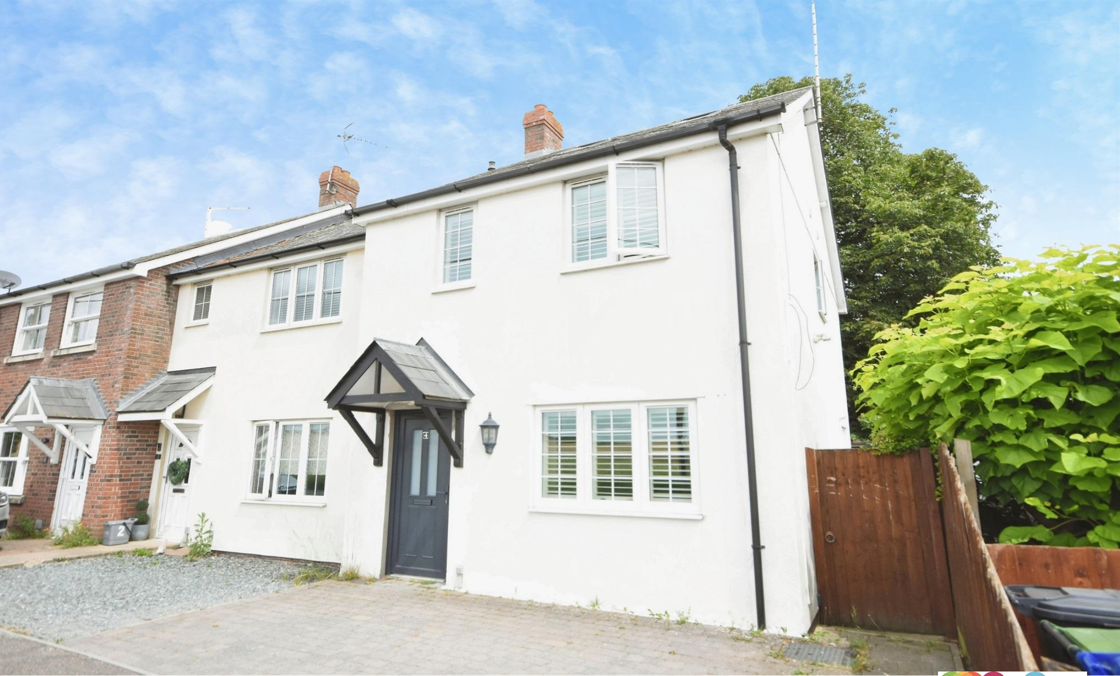
Dane Cottages, Haverhill Road, Kedington, Haverhill, CB9 7UL