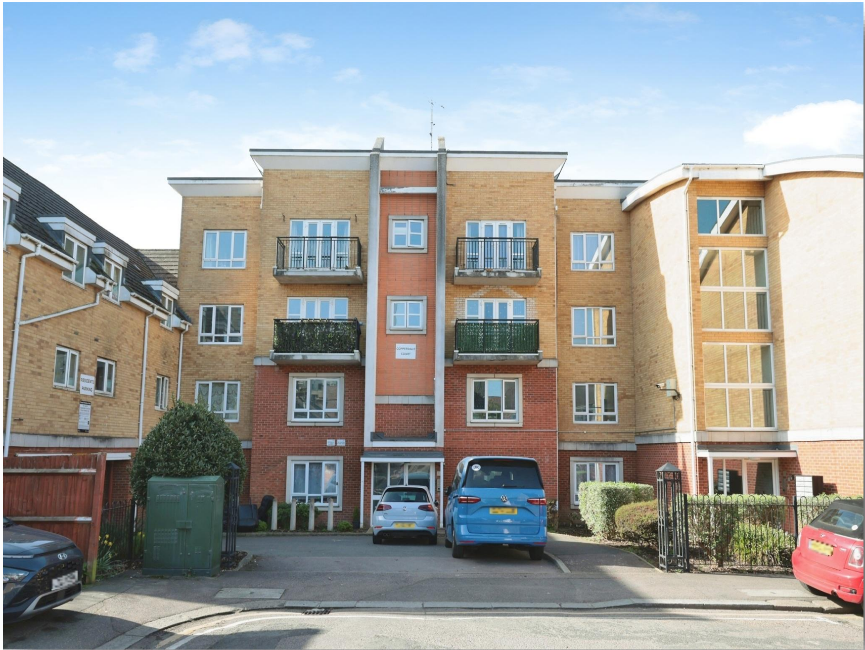
Copperdale Court, The Gateway, Watford, WD18 7HN