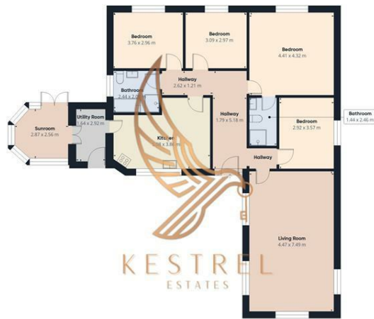
Floor 0 Building 1