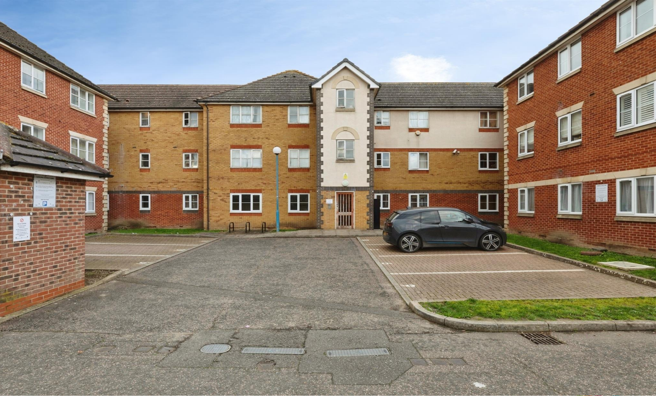
Bellingham Court, Wanderer Drive, Barking, IG11 0XN