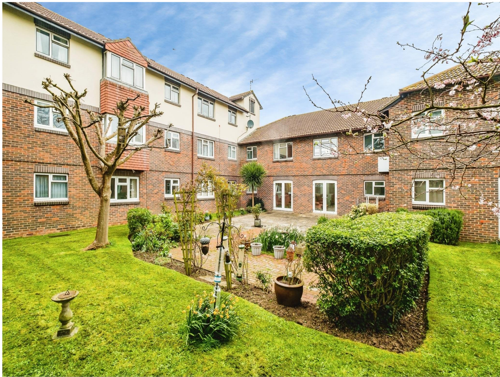
Freshbrook Court, Freshbrook Road, Lancing, BN15 8DT