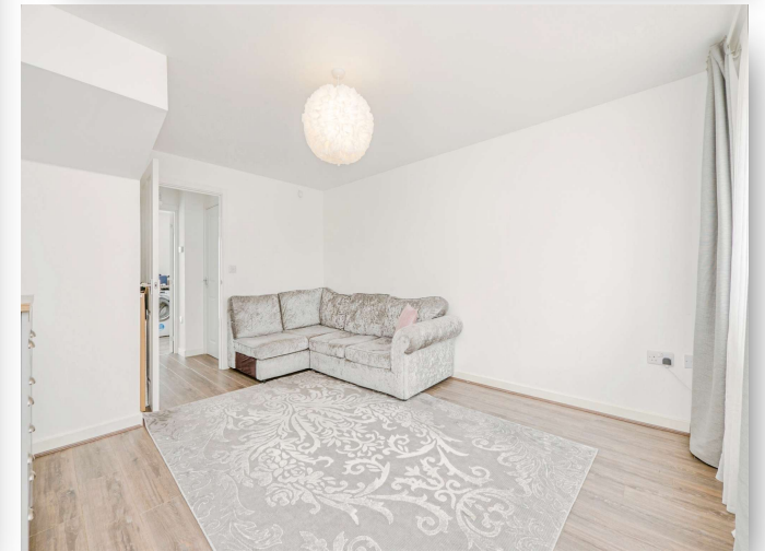
Eastside Quarter Maelfa, Llanedeyrn Cardiff CF23 9PN