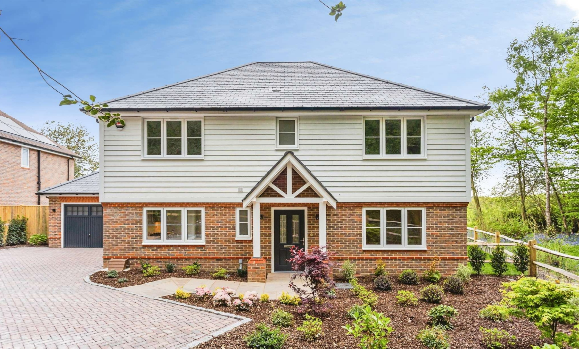
Bluebell Rise, East Grinstead Road, North Chailey, Lewes BN8 4DH