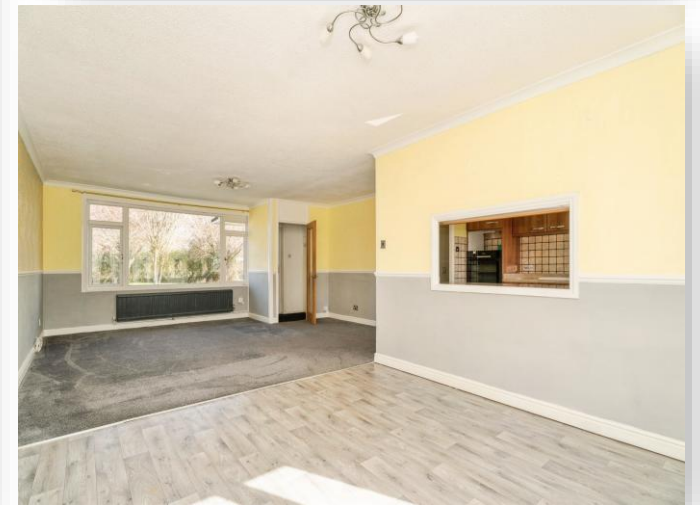
Ambleside, Wicken Green Village Fakenham NR21 7QD