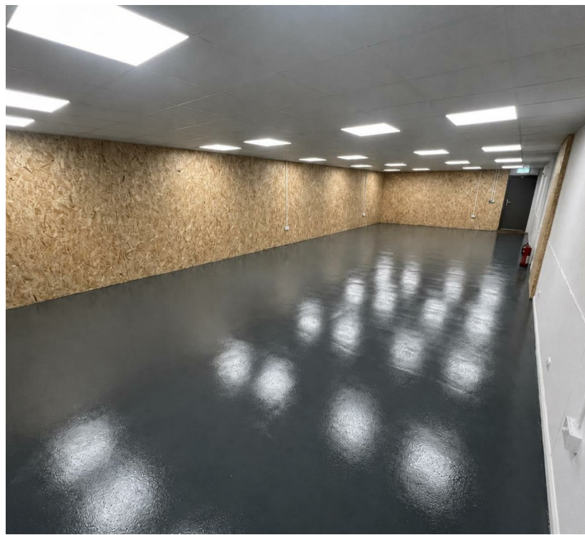
Unit 2 Thorney Road Milking Nook PE6 7PJ