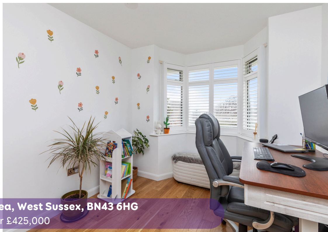
Downside, Shorehamby Sea, West Sussex, BN43 6HG Offers Over £425,000