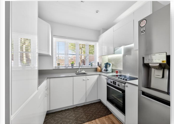
Beatrice Square, Tadworth KT20 5FR