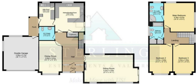
Ground Floor Floor area 145.2 sq.m. (1,563 sq.ft.)