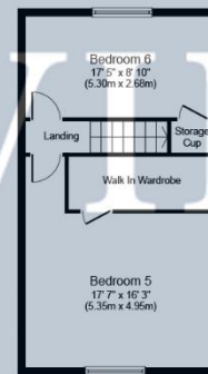
(Above Family Room)