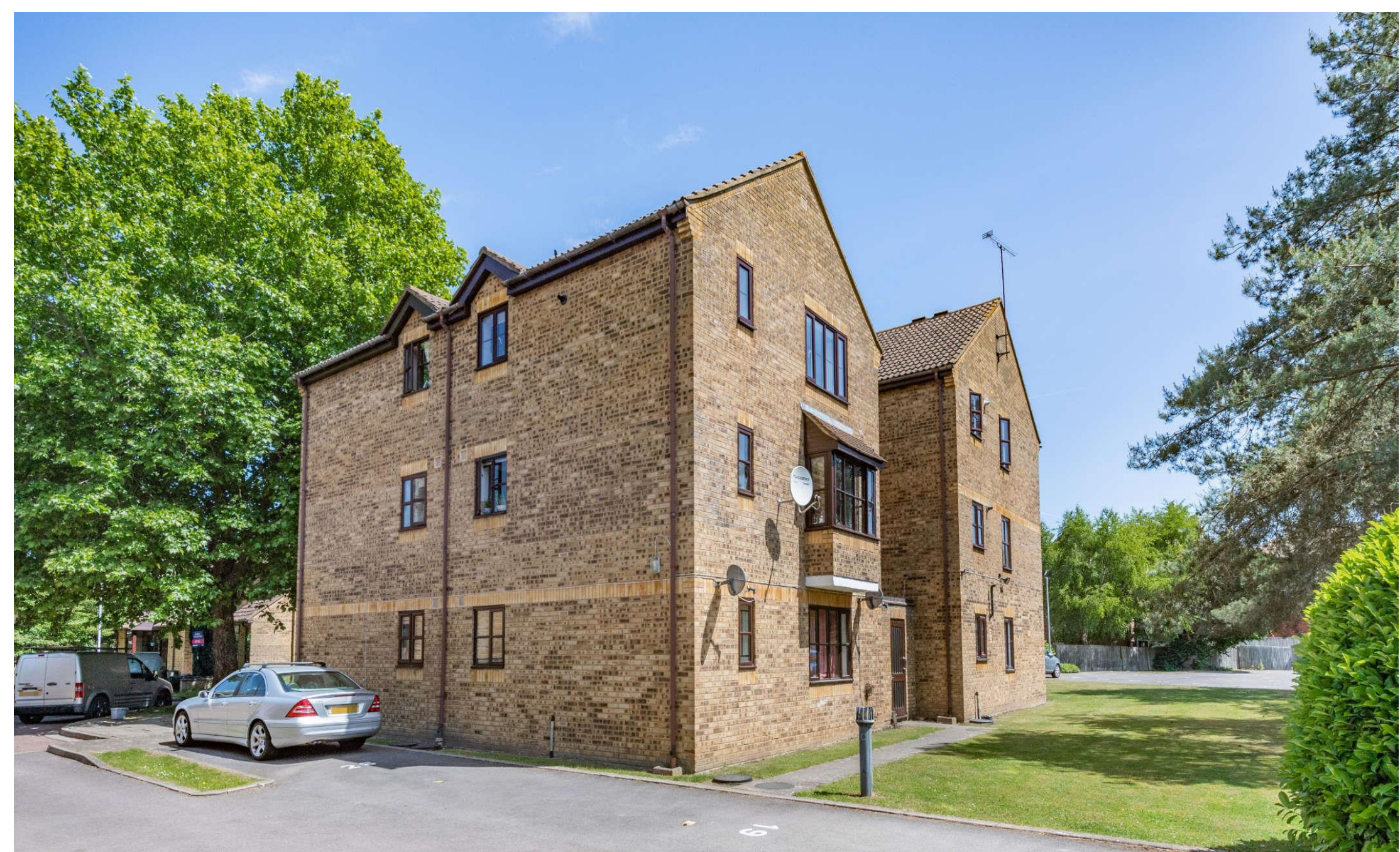
A one bedroom first floor apartment Jasmin Close, Northwood, HA6 1DQ