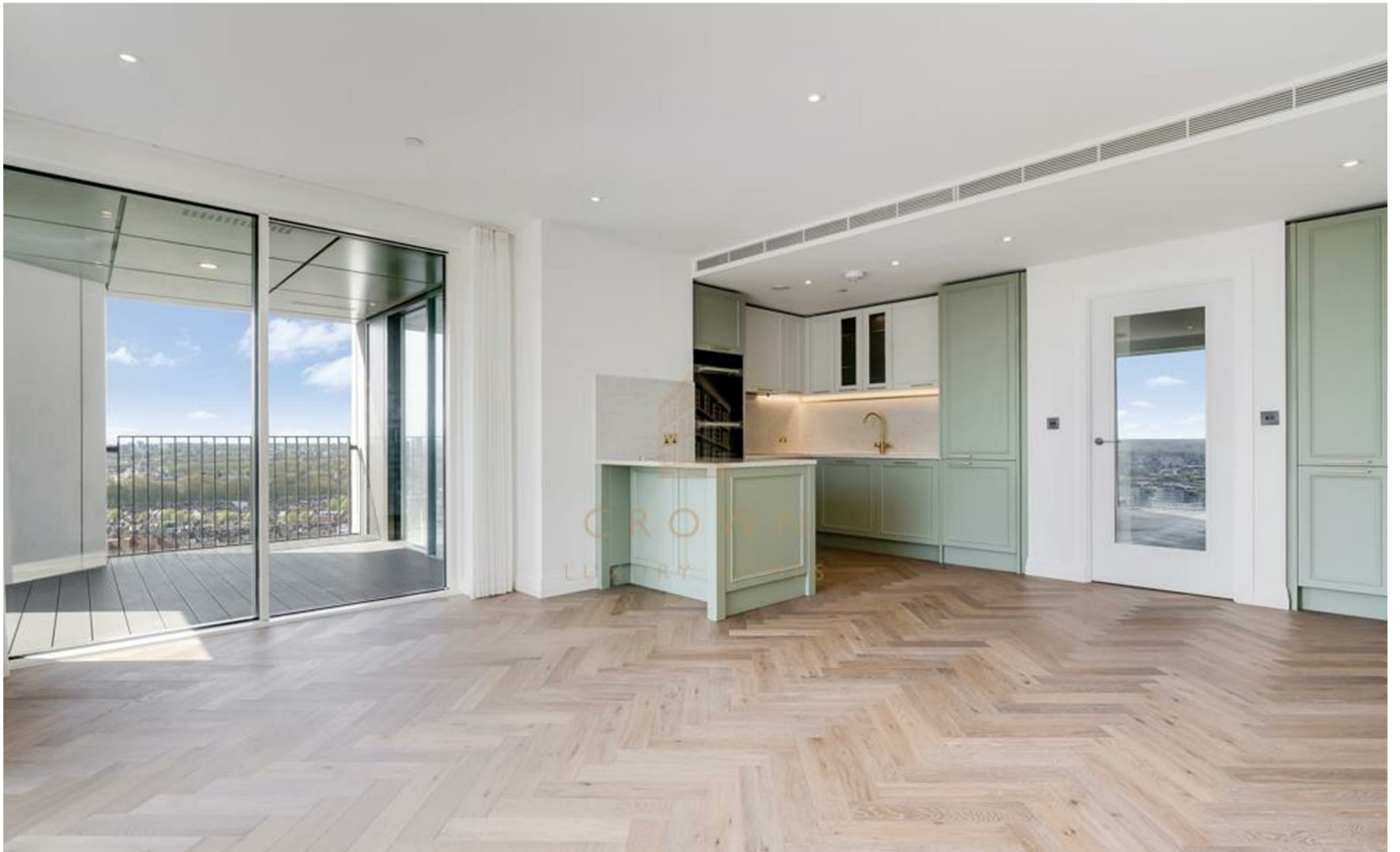
Flat 116, 2, Kings Tower Bridgewater Avenue, London, SW6 2PU £4,250