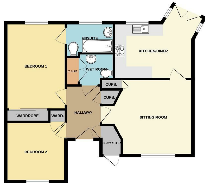
GROUND FLOOR 795 sq.ft. (73.8 sq.m.) approx.

TOTAL FLOOR AREA - 795 sq.ft. (73.8 sq.m.) approx. Whilst every attempt has been made to ensure the accuracy of the floorplan contained here, measurements of doors, windows, rooms and any other items are approximate and no responsibility is taken for any error, omission or mis-statement. This plan is for illustrative purposes only and should be used as such by any prospective purchaser. The services, systems and appliances shown have not been tested and no guarantee as to their operability or efficiency can be given. Made with Metropix ©2024