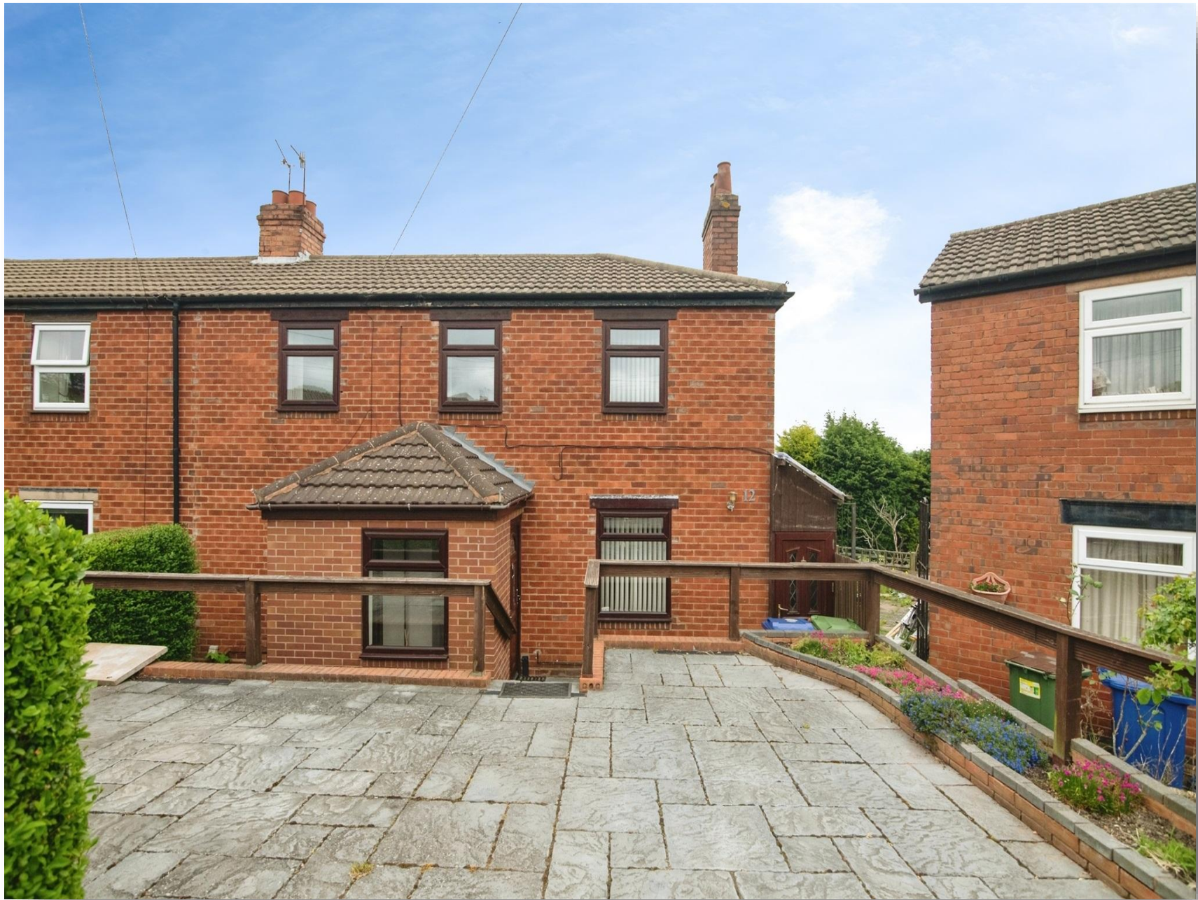
White City Road, Brierley Hill DY5 1AA