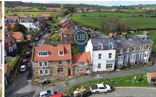
NEWTON COTTAGE, FYLINGTHORPE- 2 bed Cottage -£250,000