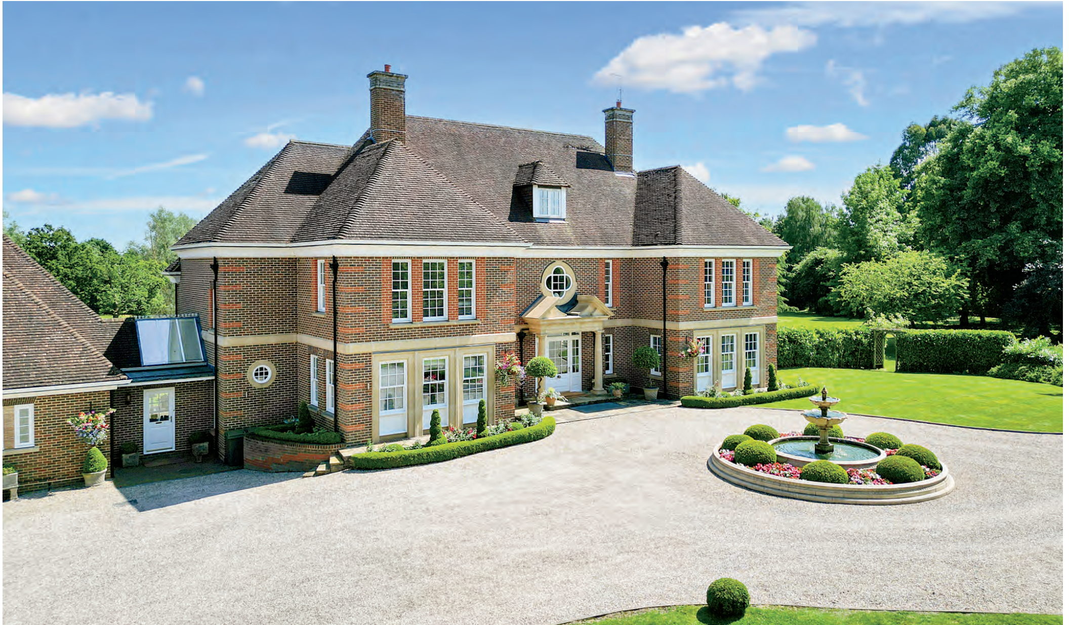
Blanket Hall Beggar Hill | Fryerning | Ingatestone | Essex | CM4 0PD