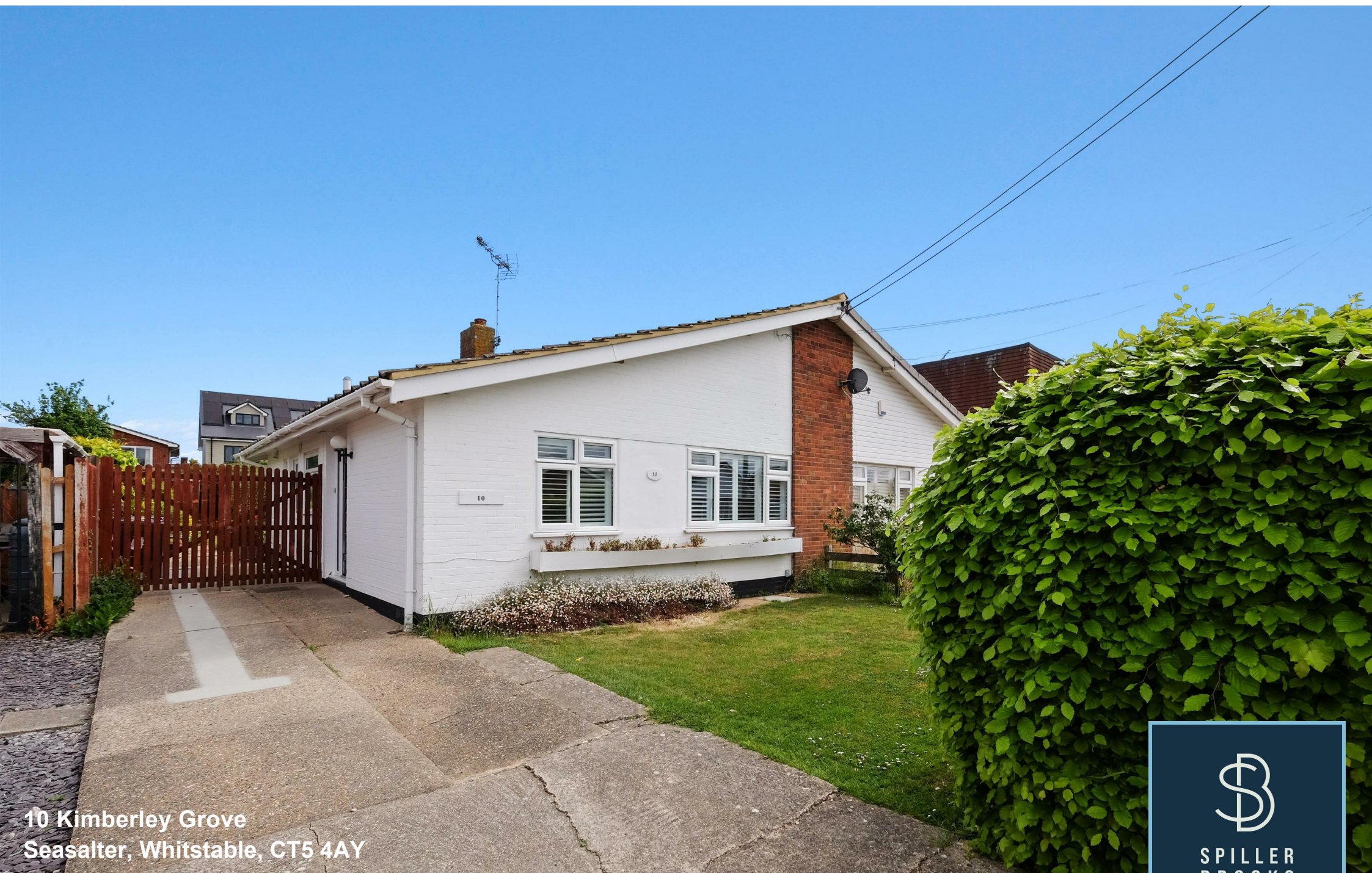
10 Kimberley Grove Seasalter, Whitstable, CT5 4AY