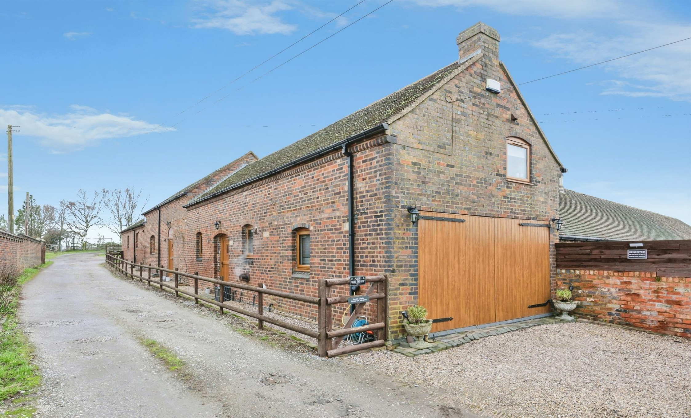
Holmleigh Barn, Slateley Courtyard, Kingsbury, Tamworth