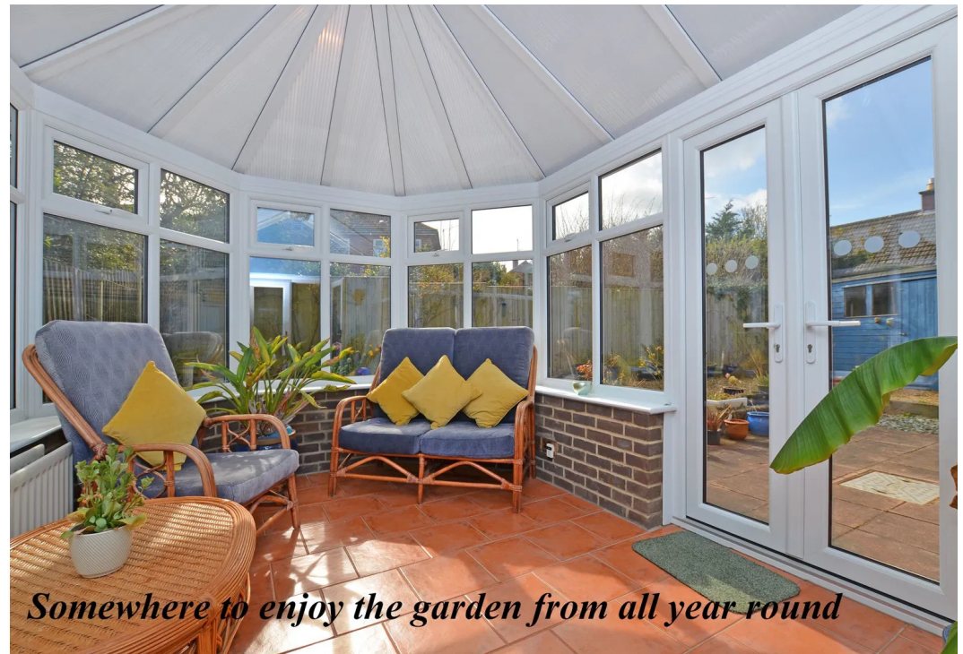
Somewhere to enjoy the garden from all year round