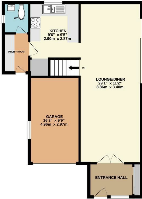
GROUND FLOOR 711 sq.ft. (66.1 sq.m.) approx.