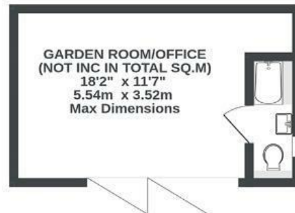
GARDEN ROOM/OFFICE 0 sq.ft. (0.0 sq.m.) approx.