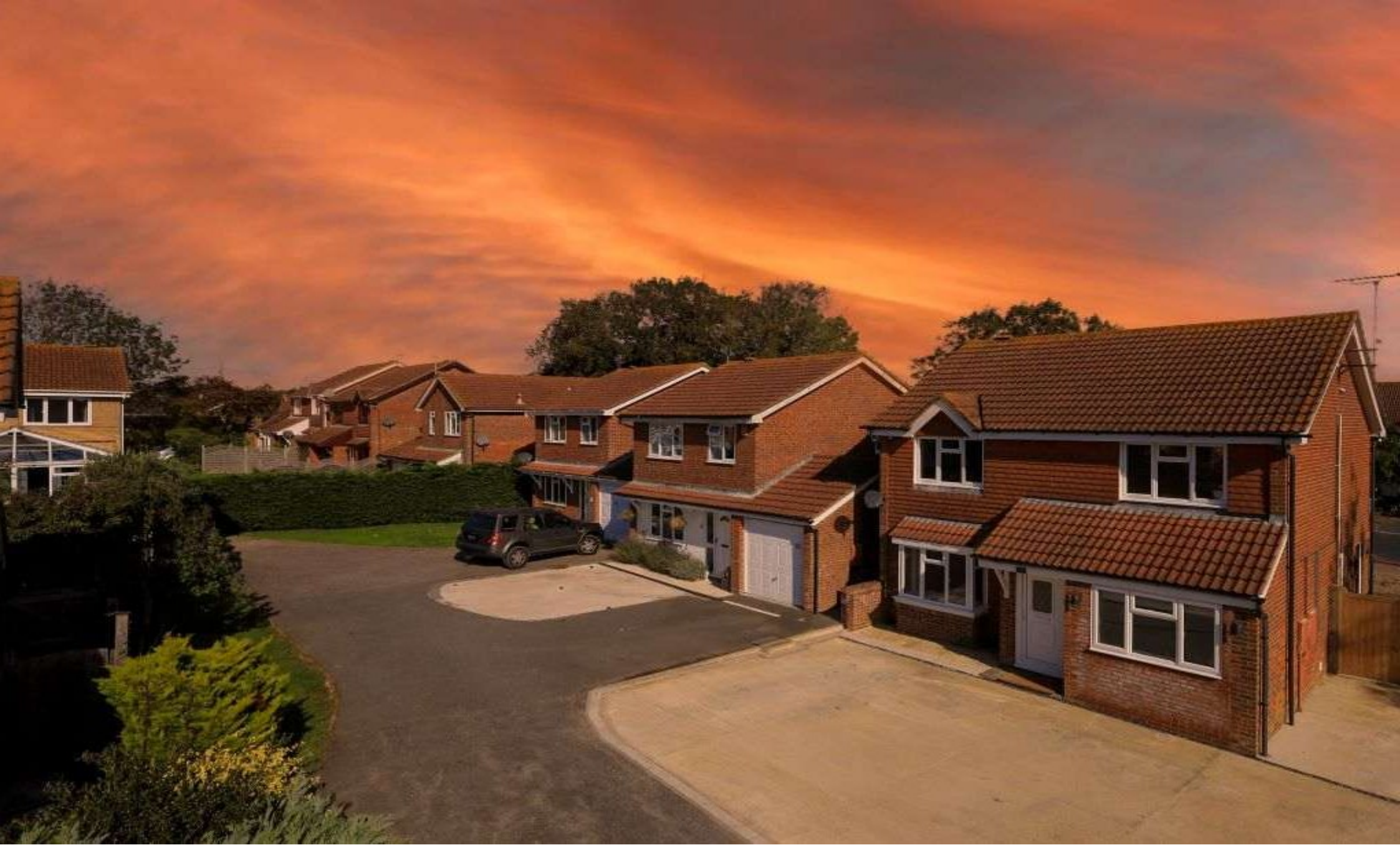
Elmwood Gardens, Eastbourne BN23 8JH