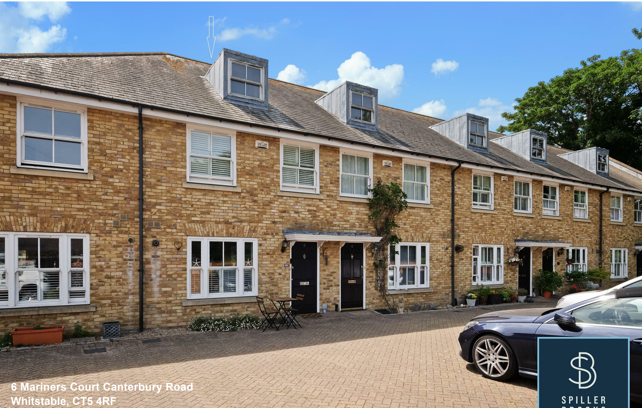
6 Mariners Court Canterbury Road Whitstable, CT5 4RF