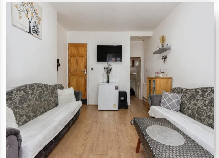
Dolobran Road, Birmingham B11 1HJ