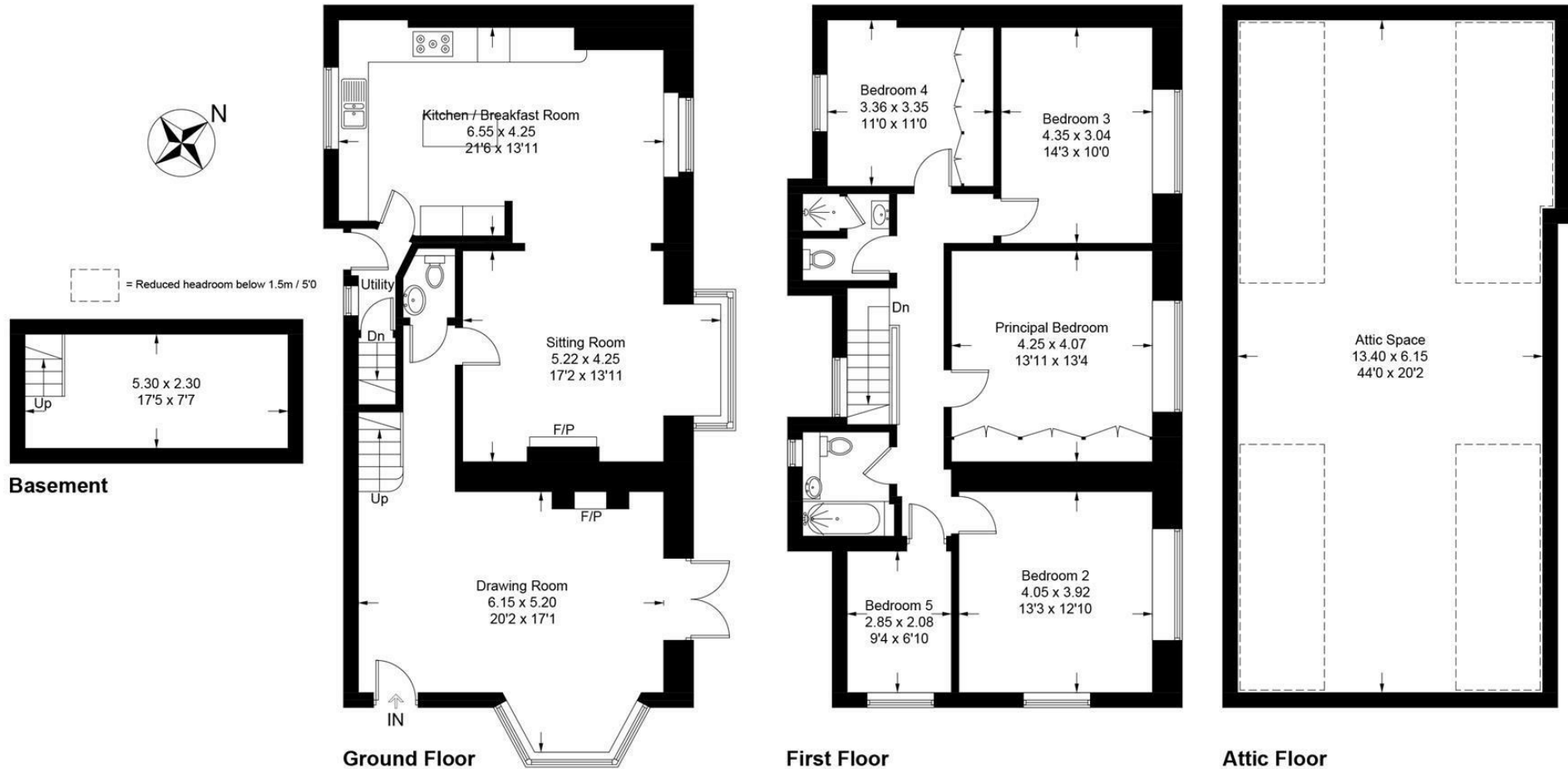
Illustration for identification purposes only, measurements are approximate, not to scale. Fourlabs.co © (ID1198978)

Approximate Gross Internal Area = 271 sq m / 2916 sq ft