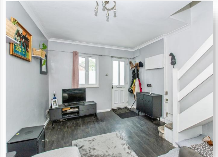
Norwich Road, Wisbech PE13 2AP