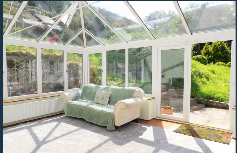
A charming Cottage in a very tranquil location