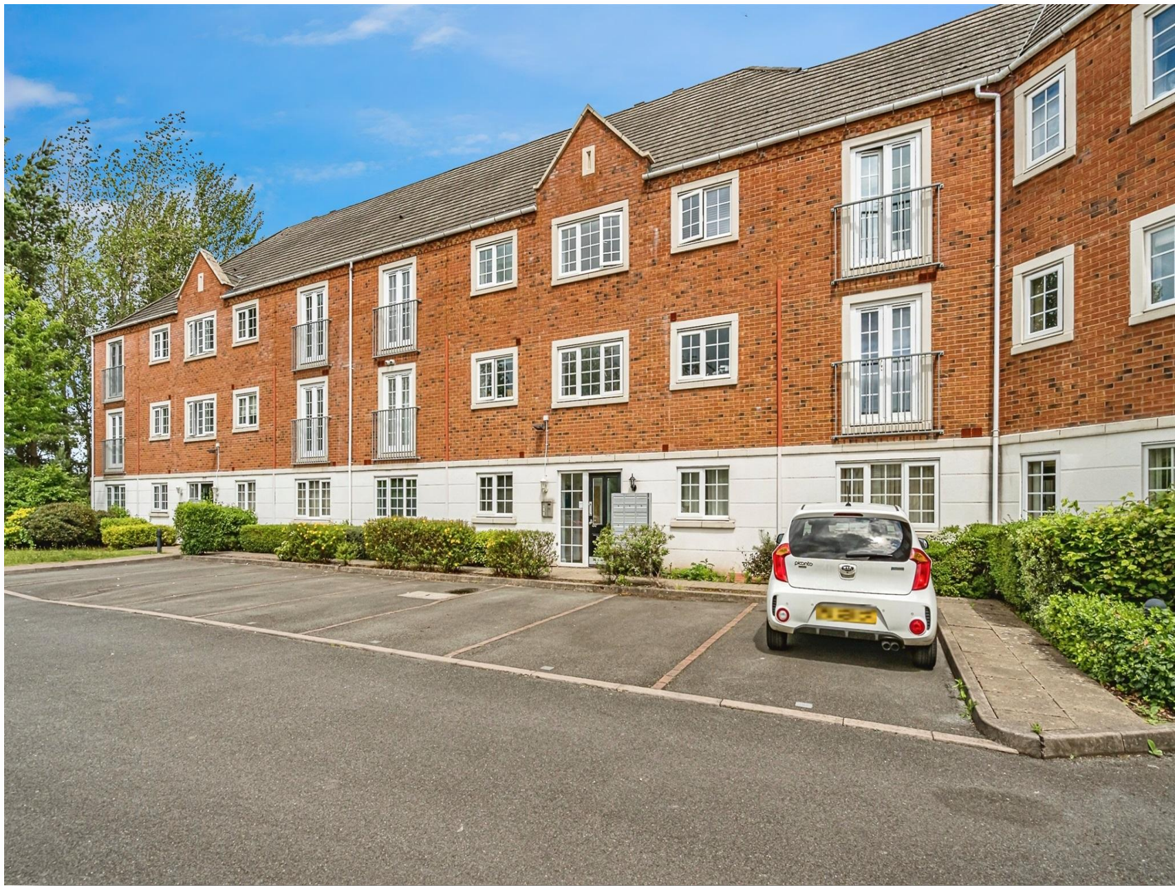
Donnington Court, Dibdale Dudley DY1 2RW