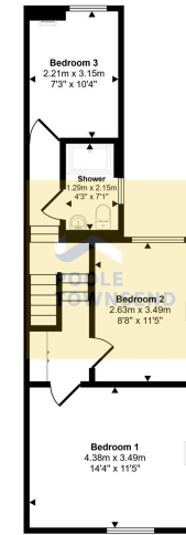
First Floor Approx 43 sq m / 468 sq ft

This floorplan is only for illustrative purposes and is not to scale. Measurements of rooms, doors, windows, and any items are approximate and no responsibility is taken for any error, omission or mis-statement. Icons of items such as bathroom suites are representations only and may not look like the real items. Made with Made Drafty 360.