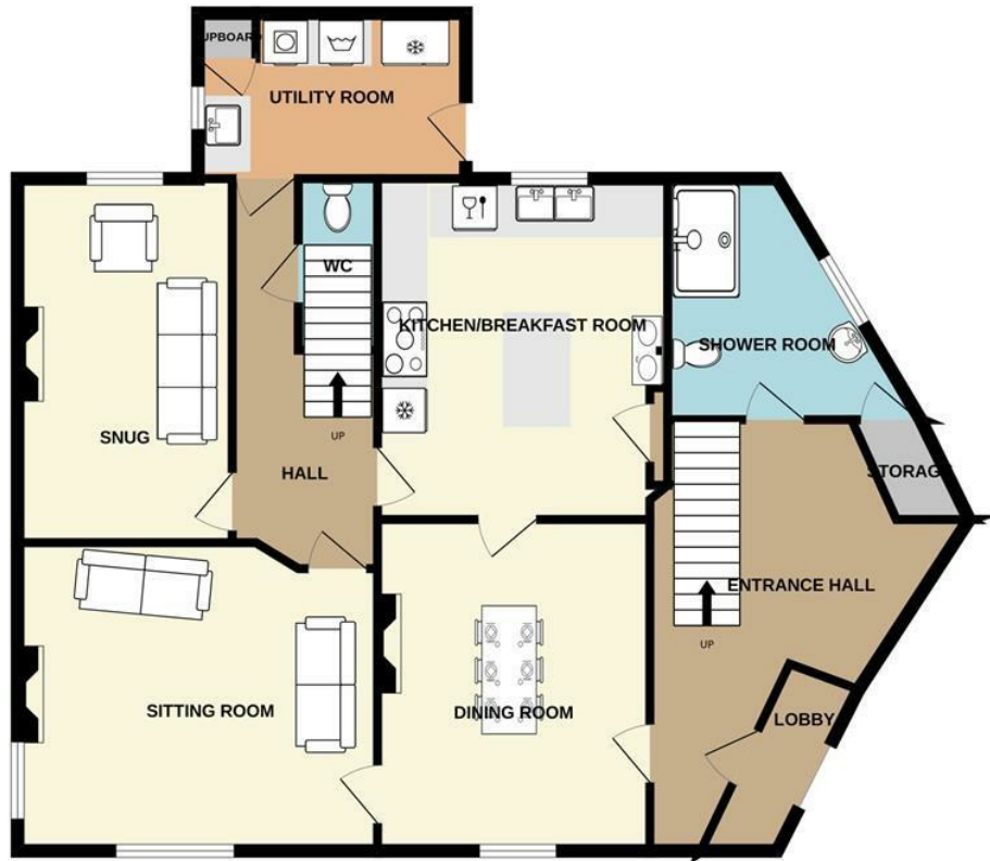
GROUND FLOOR 1143 sq.ft. (106.2 sq.m.) approx.