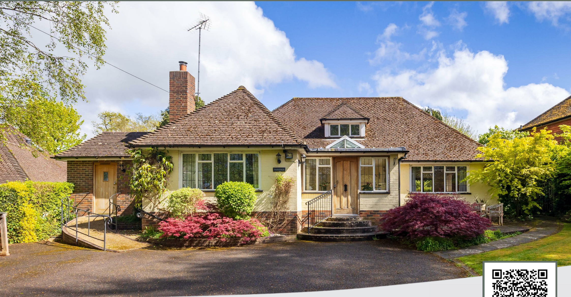
Fairdale, Chalk Lane East Horsley, Surrey KT24 6TJ