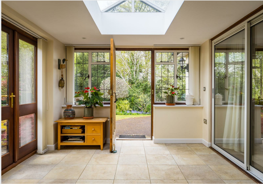
A spacious detached chalet style bungalow with over 2,000 sq ft of accommodation, nestled in this wonderfully tranquil location just 400 yards from Little Waitrose and the Duke of Wellington PH.